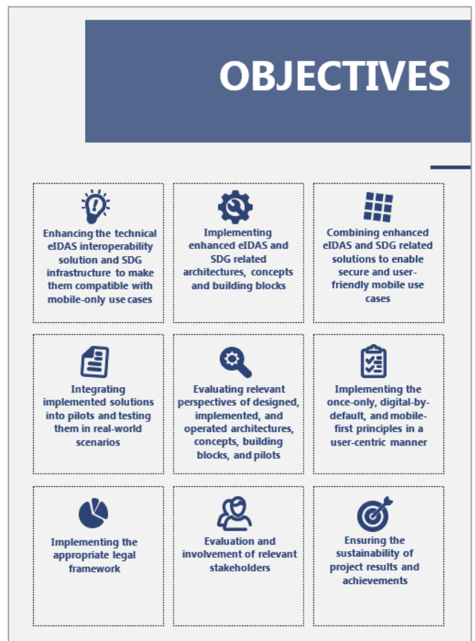
Overview of the objectives of the mGov4EU Project